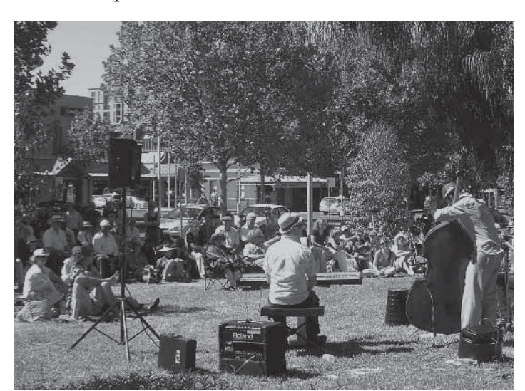
Sunday morning jazz in January

Since the Piazza's official opening in November 2009, there appears to have been little use made of the stage. Recent Sunday morning jazz events were held on the grassy, treed area on the north side of the Piazza. Hopefully, the Festival will be a good opportunity to make use of the staged area. The City of Melbourne is very open to suggestions from the community about further ways in which this space can be utilised.