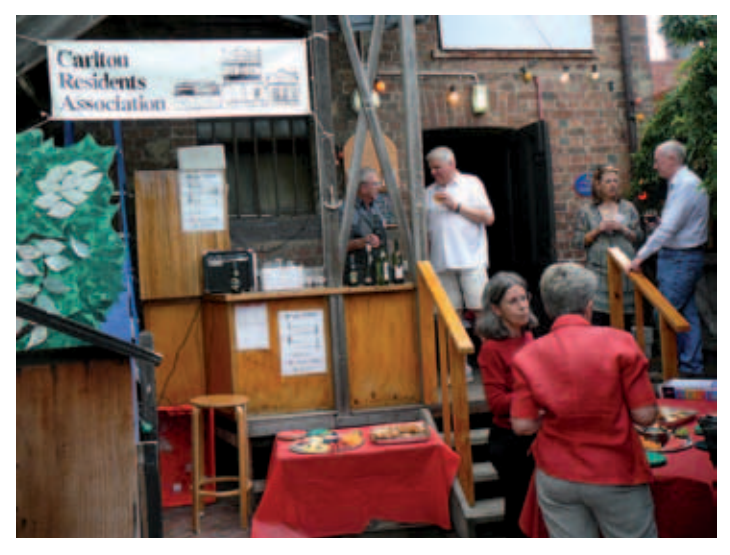
CRA Christmas Party 2009 at La Mama

Sincere thanks as always to La Mama for a unique venue, Brunetti's for tasty nibbles, and to the dedicated band of CRA volunteers who made it all possible.