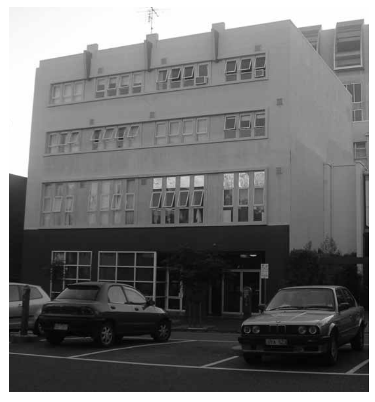
Currently student housing: is it suitable for private ownership?

The population debate is hotting up as the issue gains increasing political, media and community attention. It is something CRA will need to monitor as associated planning, transport and infrastructure pressures are confronted into the future.