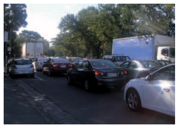
Are new roads the answer to traffic problems?

He also discussed at length the additional financial burden imposed on taxpayers by the use of Public- Private Partnerships in lieu of more economical, direct government funding, quoting instances involving hundreds of millions of dollars of potential savings.