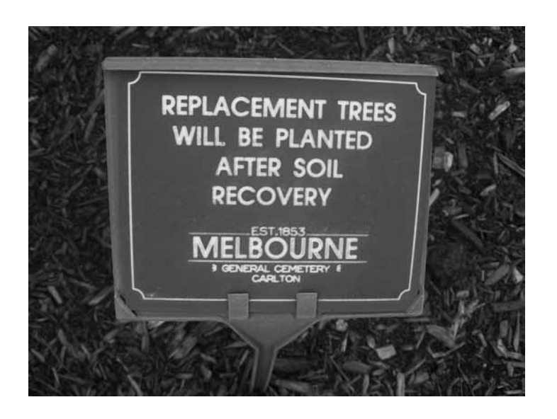
Golden Cypress trees have been removed along the Lygon St boundary of the cemetery