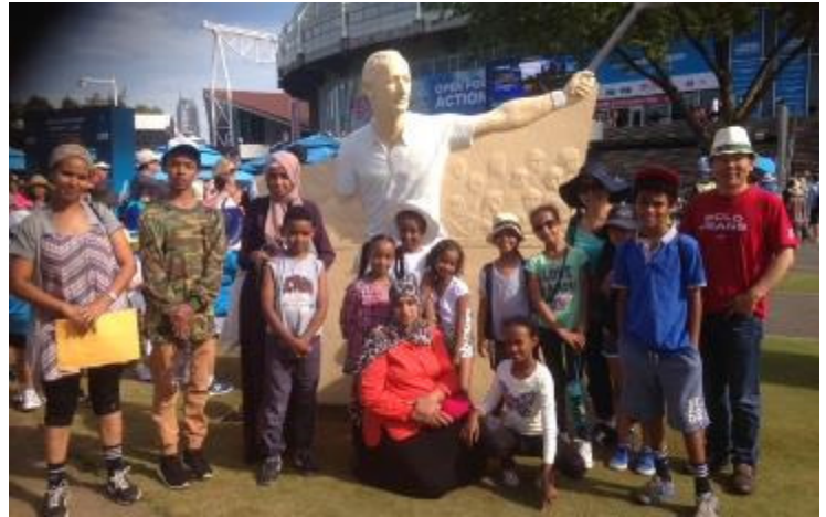
The Australian Open visit 2016

On behalf of the Carlton Gardens Tennis Club, Church of All Nations, Carlton and Tennis Victoria, the program was nominated for an award to celebrate those members of the community who have done the most to improve understanding between Muslims and non-Muslims in Australia.