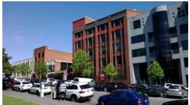
A Statement of Significance has been gazetted for those Heritage Places on Lincoln Square South

it is the replacement of the A to D Grading system [a system that has been in place for thirty years] with a revised system, that categorises properties as significant, contributory or non-contributory that will have the most impact. Hundreds of heritage places that were previously designated as significant will be categorised as contributory, if the recommendations from the consultants are accepted. While there is certainly a need for a Statement of Significance for the large Carlton Heritage Overlay, there is probably an even stronger argument for separate statements for some of the smaller precincts where significant heritage assets are located. The separate Heritage Review undertaken as part of the City North planning study [concerning that area west of Swanston Street and south of the University] included Statements of Significance for quite small precincts, including the Lincoln Square South Precinct [see image below]. If they can be justified for this precinct, they can be certainly justified for the site of the first Children’s Hospital on Pelham Street, and for the University Square area of Carlton [see image below].