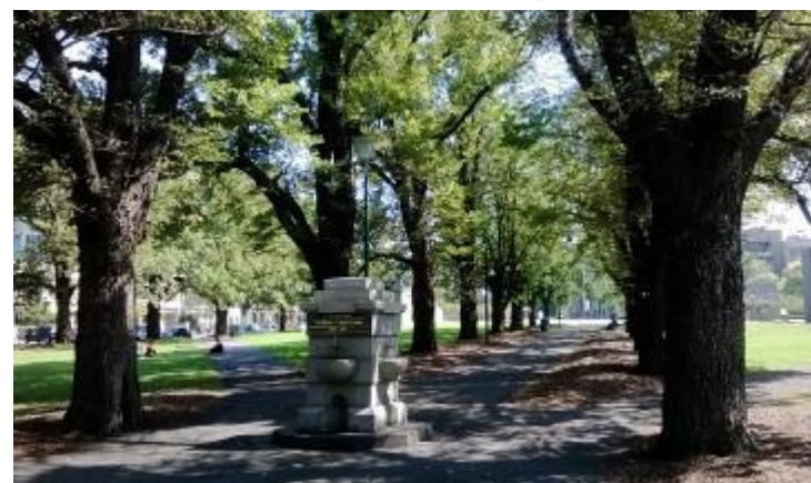
The HO1 Heritage Precinct west of Swanston Street requires a separate Statement of Significance; it includes the University Square and significant heritage places on Barry Street, Leicester Street and Grattan Street [east of Leicester Street].