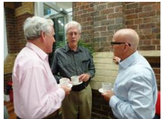
The guest speaker with CRA members

George also stressed the major role that the CRA Planning Group had played in stopping the inappropriate redevelopment of the current Downtowner Hotel site on the corner of Lygon and Queensberry Streets. A planning application had been lodged to build a 13 storey apartment block when the area has a height limit of only eight storeys. It was proposed to construct small one and two bedroom units with inadequate light and ventilation.