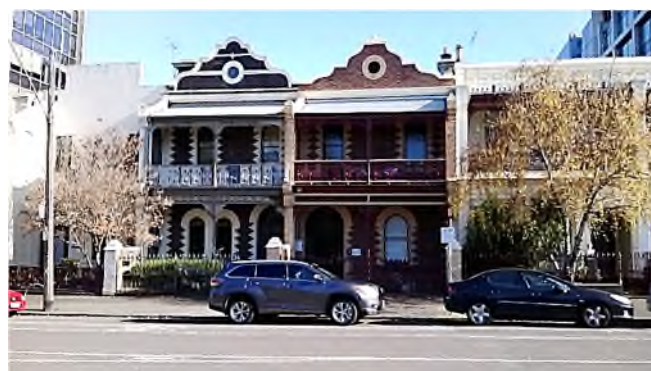
139-141 Barry Street