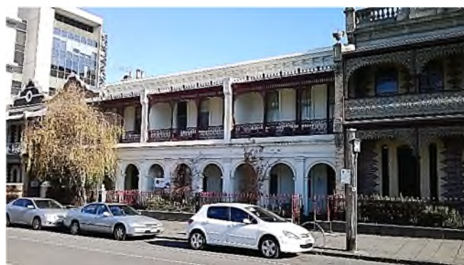
147-151 Barry Street

Barry Street has been graded a Level 1 Streetscape for thirty years; what has changed? Although the new buildings at the Pelham and Grattan Street corners may have degraded the streetscape at these locations, this should not have influenced the Streetscape Grading between 131 and 151 Barry Street.