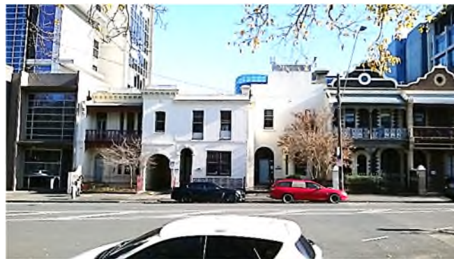
131-139 Barry Street