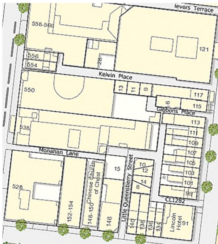
Lincoln Hotel recorded at 128-132 Queensberry St

Cardigan, Queensberry, Swanston & Kelvin Place Block