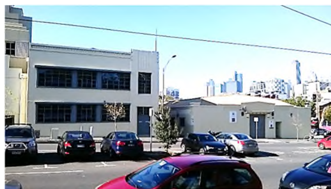
168-178 Leicester Street [Query grading of 174-178]