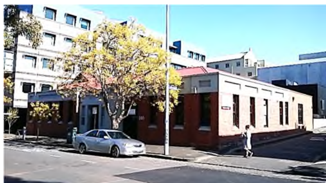
233 Bouverie Street [not 197-235 Bouverie Street]