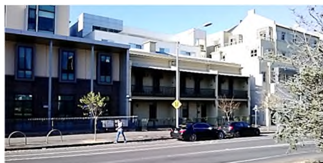
210-214 Leicester Street [216 demolished] EO 18 July 2018