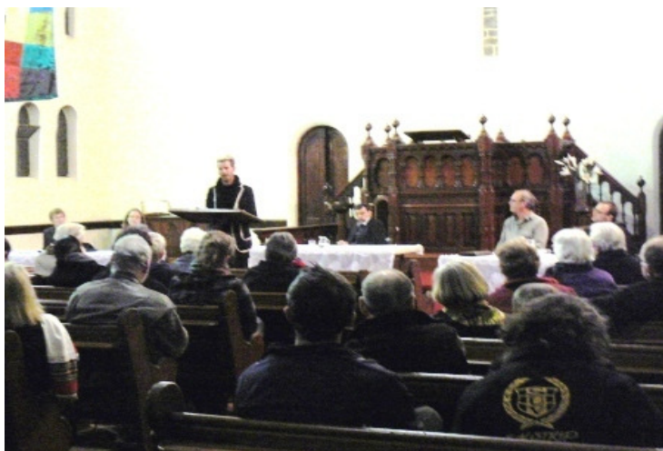
CAN hosts Candidates Forum

opposes:- Labor's proposed Internet filter - does not believe it is the most effective way to tackle the problem.