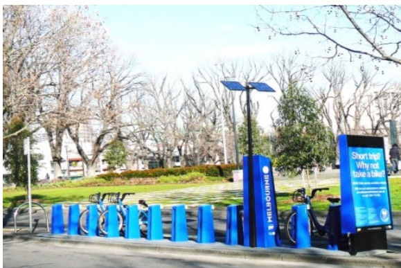
Bike Hire Station near Argyle Square

On 31 May 2010, Roads Minister Pallas launched a bike hire scheme for Melbourne. The RACV has been contracted to operate it. The Scheme will cost $5.5 million over 4 years; it provides 600 bikes docked at 50 stations around the City. Initially 3 docking stations were sited in Carlton: Lygon St.-Argyle Square, Faraday St.- Dorritt St., and Melbourne University-Tin Alley.