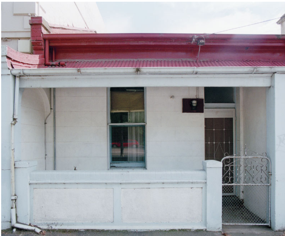
266 Elgin Street: The Front