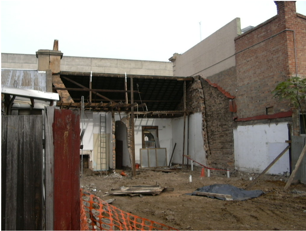
266 Elgin Street: The Back

Other VCAT cases coming up in 2005 are at 264 Swanston Street where one of the original timber houses in Carlton opposite Newman College has a plan for demolition and development of a 3 storey student accommodation building. Don Chambers and Peter Sanders will represent CRA on this case. The Lemon Tree Hotel is also likely to be a major effort by many members to ensure that the proposal to re-open the building for a hotel is not successful. We believe that our main grounds of objection (discretionary use in a Residential 1 zone) will be successful, and will support the local residents in their vehement objection to the proposal.