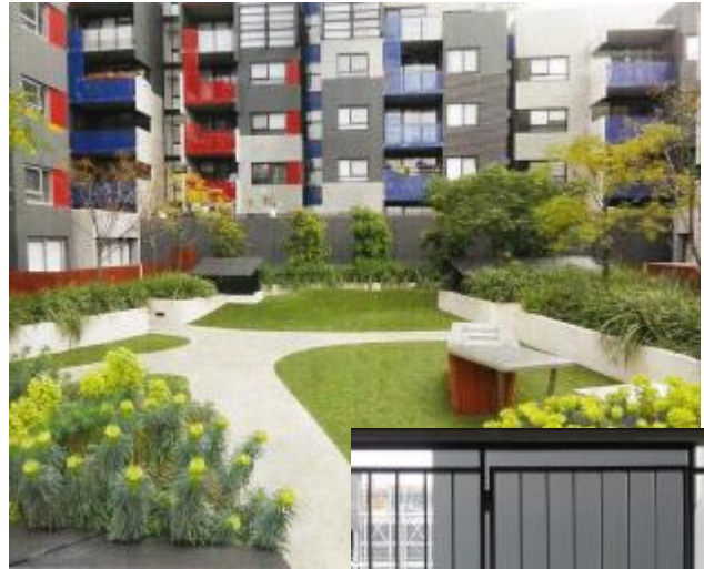
The private garden above viewed by public tenants through a locked gate at right

occur naturally, and regretted that the planned community space of 700 sq.m. was not provided. Some said that politicians and DHS (Dept. of Human Services) had yielded to developer pressure.