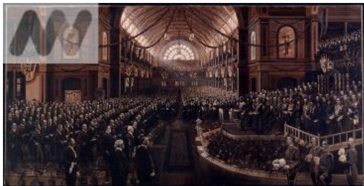
'The Opening, Commonwealth Parliament', Charles Nuttall