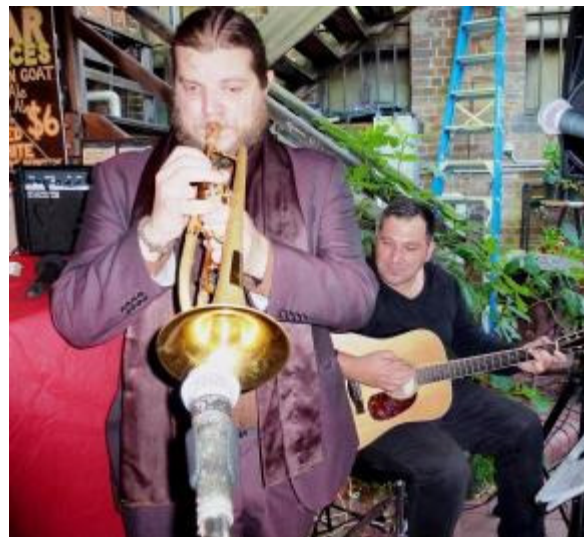
No Strings Attached

Our Christmas party was even more fabulous than in previous years. On a balmy December evening, CRA members, friends and guests celebrated in La Mama's unique forecourt where they danced into the early hours of the