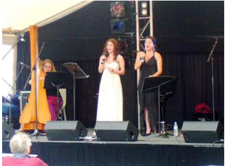
Vocal competition at La Dolce Italia Festival

children's activities all added to the festive atmosphere of Lygon Street, somewhat dampened by the inclement weather. 'Pavarotti' and 'Carmen' dropped by to entertain the crowd. All in all, it was a memorable event for Carlton and a credit to the organising committee.