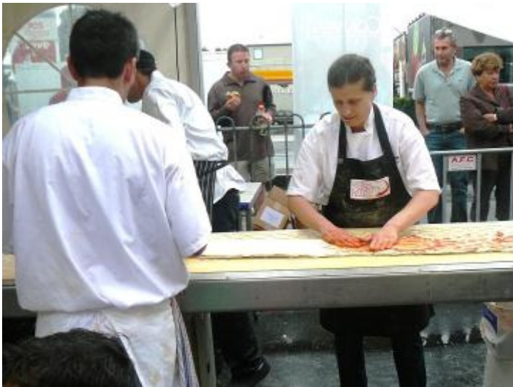
World record attempt for World's longest pizza

The weekend of 26-27 February saw the closure of Lygon Street for this popular Italian festival. A feature this year was an attempt on the Guinness World Record for the longest pizza, 1.2km (Elgin to Victoria Streets). Despite wet weather and the Laws of Physics (friction), a pizza length of 600m was achieved - an Australian record!