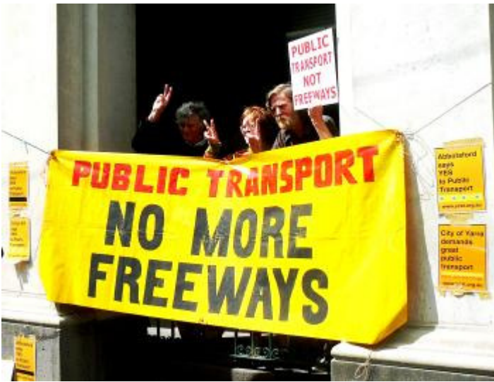
Protectors of Public Lands rally in support of public transport

In late February, several CRA members joined a rally organised by Protectors of Public Lands outside Collingwood Town Hall to support and encourage the above new and exciting directions in State transport policy.