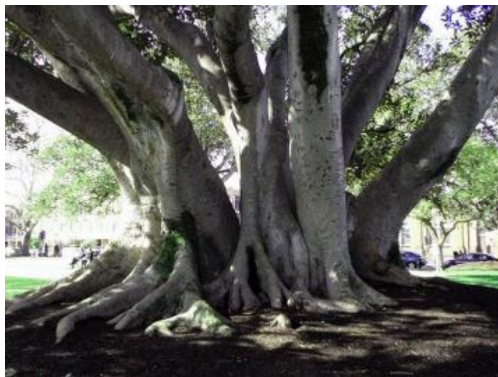
The Historic Morton Bay Fig