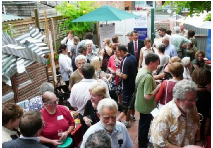
Christmas Party 2010