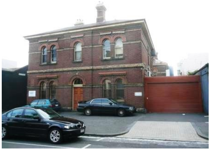
The OLD Carlton Police Station Drummond Street

Well, not quite, but they were kept cool by an early example of the Tobin Tube ventilation system. It is because of this that the Heritage Register lists the Police Station as having scientific significance as well as historical and architectural importance.