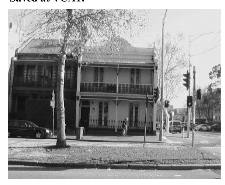
Heritage terrace house, 69-71 Drummond Street