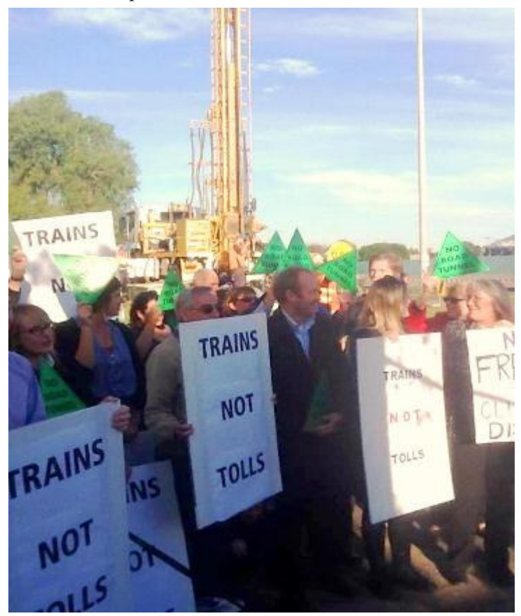
Pro-train Rally, Alexandra Parade, drill rig in background

In a surprise announcement on 1 May 2012, the Baillieu Government approved the controversial East-West Road Link from the Eastern Freeway (tunnel proposed by Sir Rod Eddington in 2007), as its top priority transport project. This project was soundly rejected by the community in 2008. On 17 May this year, Premier Baillieu officiated at a ceremony in Alexandra Parade marking commencement of geotechnical drilling of 50 boreholes in preparation for construction of the $10 billion Link. Around 50 protesters with banners attracted extensive media publicity by picketing the drilling site. These preliminary $15 million works are being funded by the State Treasury; the Federal Government refused to fund the project ( Protectors of Public Lands and Public Transport Users Association members had earlier visited Canberra to lobby against Federal funding support). The Premier claims the Link will be attractive to the PPP (Public Private Partnership) infrastructure industry. However in the current stressed financial climate, meaningful progress on it is unlikely, even if commercial partners can be found.