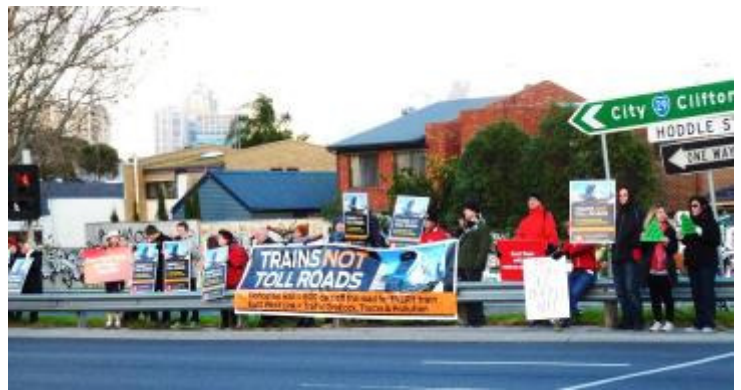
Part of the 'Trains not Toll Roads' Rally on Hoddle Street, at the Freeway exit

including plans for compulsory property acquisitions and construction impacts. This has led to great distress among those likely to be directly impacted in Collingwood, Parkville and Flemington. The extent of open-cut construction through Royal Park is yet to be revealed. At best, LMA provides 'public consultations' on already taken design decisions. Community protest rallies involving hundreds of people were recently held at each end the Toll Road route.