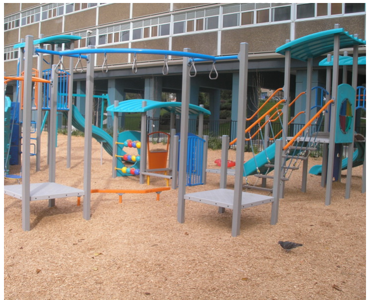
New playground adjacent to 510 Lygon Street

Keppel/Cardigan Precinct - The design is progressing on the next stage at this site, albeit with the additional demands imposed because it involves the existing historic buildings.