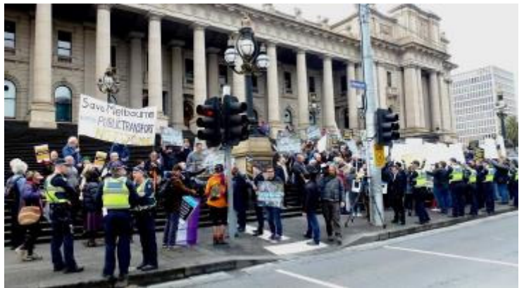
Parliament House rally of pro and anti EW Link protesters

The pro-EW Link rally appeared to be a 'last ditch' stand by disgruntled Liberals in support of their disbanded project. While this group enjoyed the support of former PM Abbott, PM Turnbull's decision to 'unlock the box' of EW Link Federal funding for alternative transport projects has undermined the thrust of their campaign.