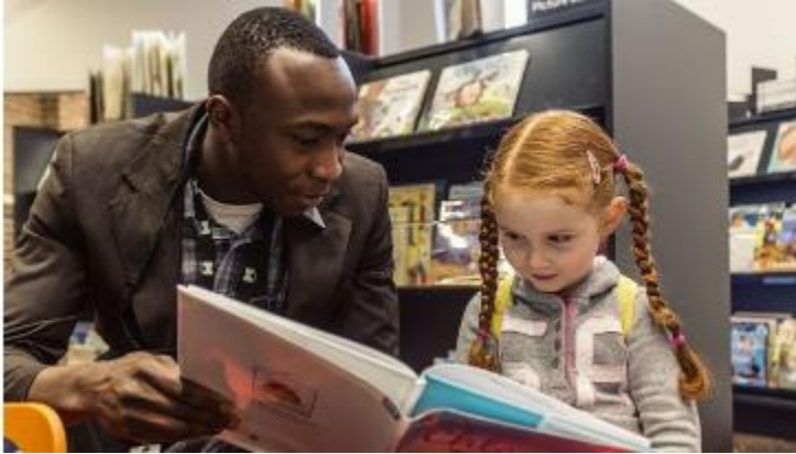
Story time:

traditional and digital items to suit everyone, including books, DVDs, CDs, magazines, and eBooks. Children can join book talks, meet authors, read the latest releases, and attend story time sessions.