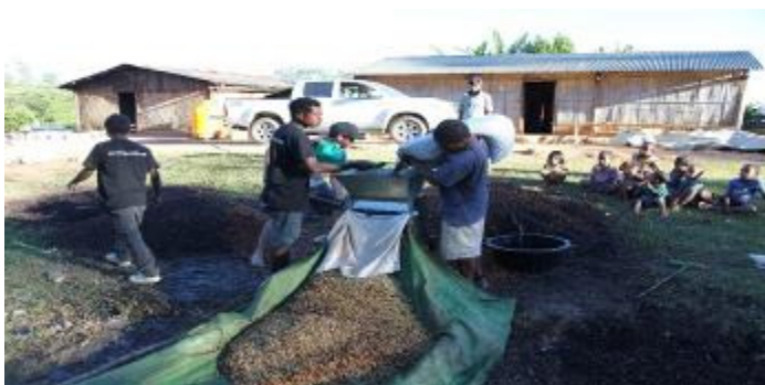
The new Pulping machine in action at Belumahatu

This project we use in cafes to raise money to give communities coffee pulping machines that will help improve the quality of the coffee pulping to International standard as well as speeding up the initial pulping times so the coffee does not ferment, thus producing a better quality coffee.