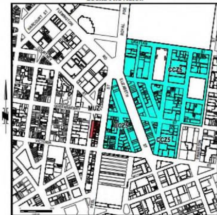
MELBOURNE PLANNING SCHEME LOCAL PROVISION