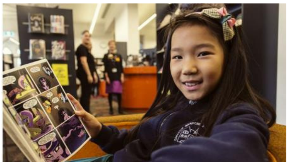
Enjoying a graphic novel