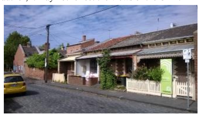
1 to 7 Charles Street

This opinion piece reflects the personal view of the author; it may not reflect the views of the CRA.