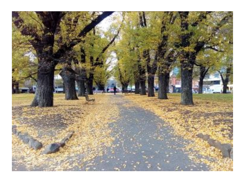
Argyle Square Winter 2017

If you love Carlton but do not reside or own property in postcode 3053, please join as a 'Friend of Carlton'.