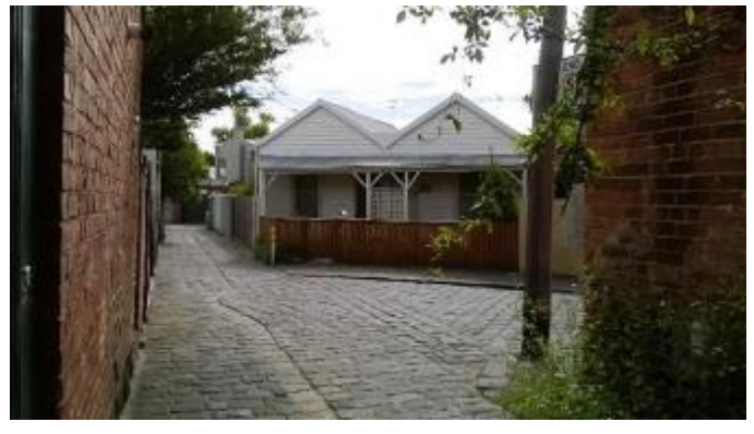
24 Charles Street