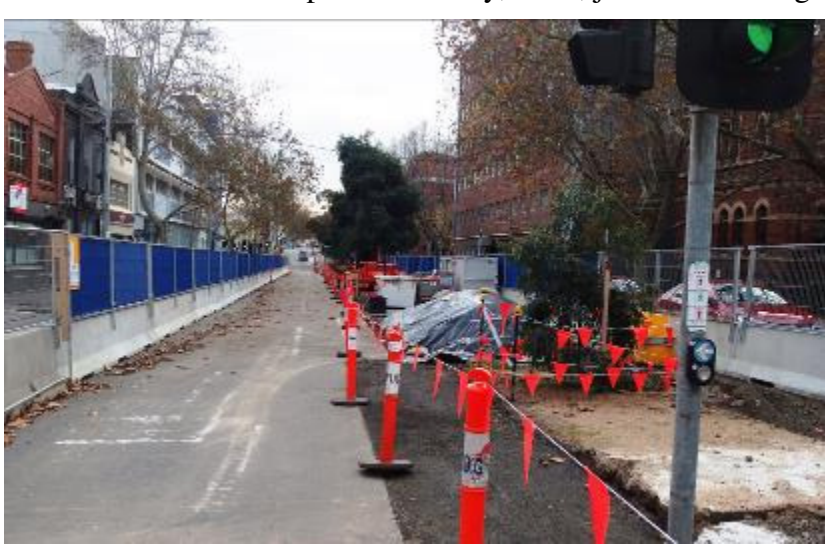
Queensberry Street make over in progress

Representatives of CRA met with the City of Melbourne and MMRA executives and experts on 5 May, 2017, just one working