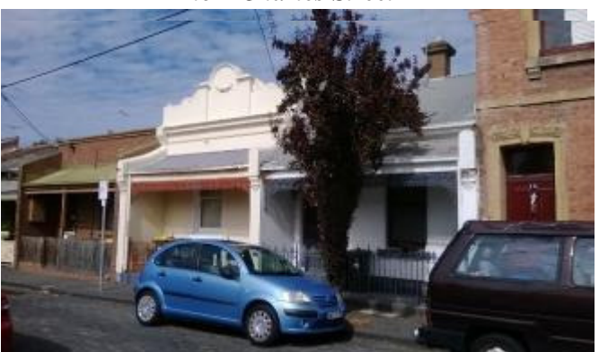
9 to 13 Charles Street