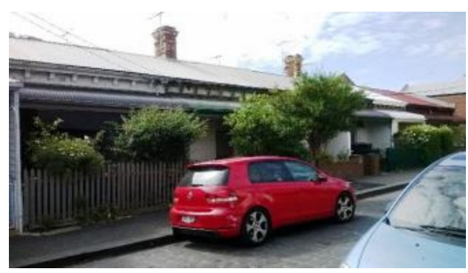
2 to 14 Charles Street