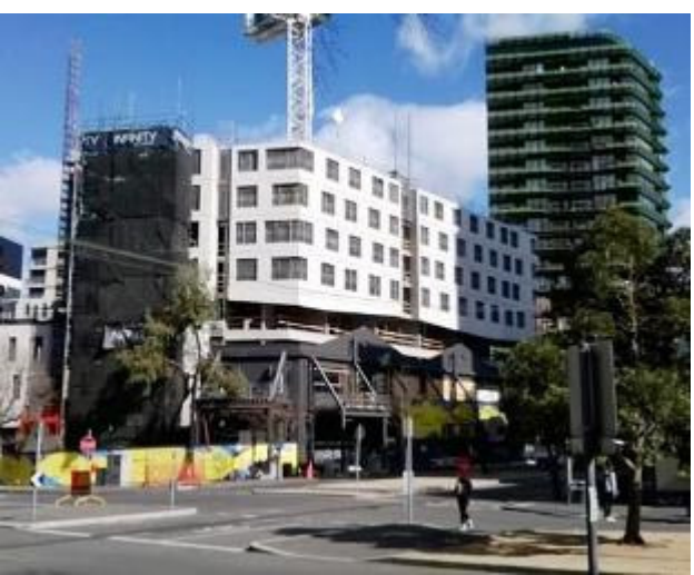
The former Reece Plumbing building

Other important planning objectives that address amenity impacts on adjacent sites and ESD matters are also being challenged.