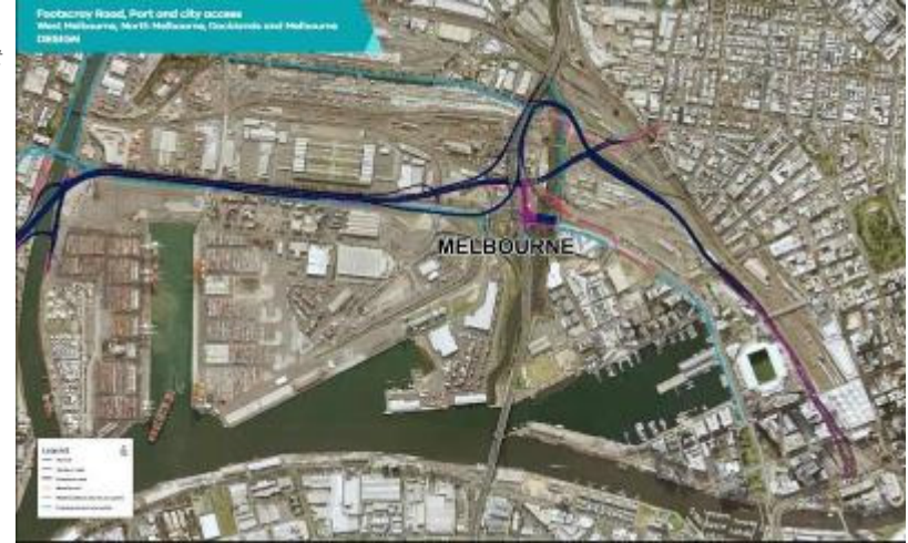
Footscray Road, Port and city access

increased traffic on suburbs bordering the city, including Carlton.