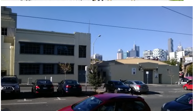
168-178 Leicester Street [Query grading of 174-178]