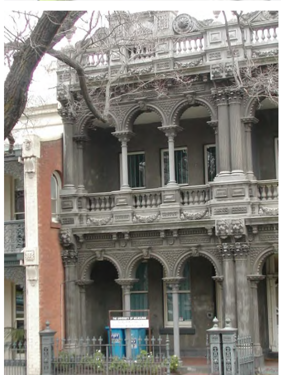
21 Royal Parade, Parkville