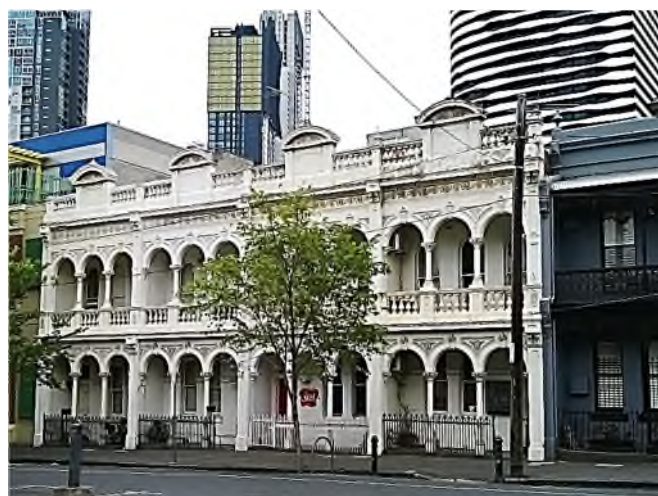
51 – 57 Cardigan Street – not part of a significant streetscape?