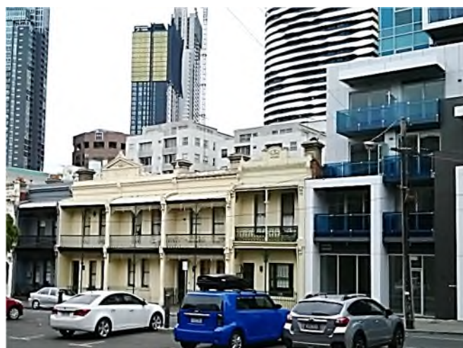
59 – 73 Cardigan Street [Note position of terrace at no 71 Cardigan Street on both maps]