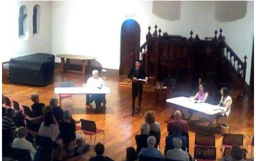
The Election Forum hosted by Church of all Nations and CRA

Four State election candidates accepted the invitation to attend the Forum on Monday 12 November.