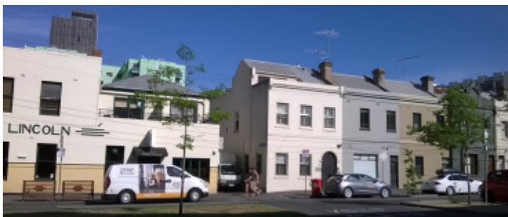
No 99 Cardigan Street is illustrated in this image; it is the three level building just north of the Lincoln Hotel

This place, although likely to be of more recent construction than the C Graded Heritage Places to the immediate north, should have been included in a Heritage Overlay; it wasn't. There is nothing in the current planning controls [Heritage or Design and Development] that would prevent an entirely INAPPROPRIATE development at this location. Heritage Overlays and Heritage Policies have been used [and should continue to be used] to guide the development envelope [and architectural language] of NON-HERITAGE sites. Further, the appropriate curtilage for terrace rows should NEVER be defined by site boundaries; to do so would be inconsistent with the curtilage guidance included in Planning Practice Note 1