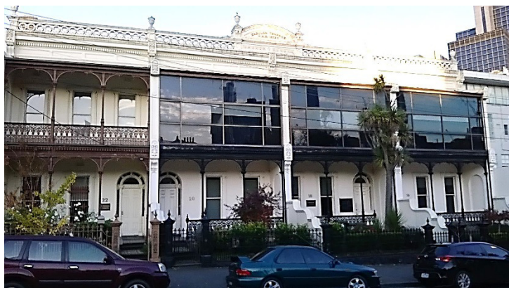
16-22 Drummond Street Carlton – Existing Condition

Although the concessions by the Applicant were welcomed by the CoM and the remaining objectors, they were not sufficient to allay the concerns in regard to the excessive demolition, heritage and other non compliant aspects and so the remaining objectors continue as parties to the VCAT hearing in August.