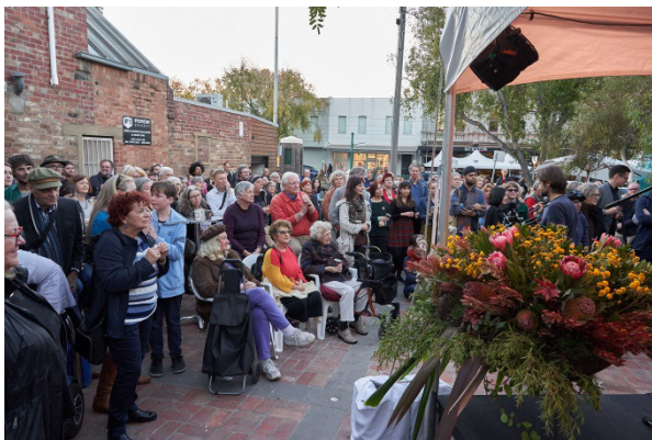
Anniversary Community event

Renders have been used to help illustrate the project but cannot exactly represent the final project. The final materials and finishes may differ from those shown in the images. Renders by Cottee Parker Architects