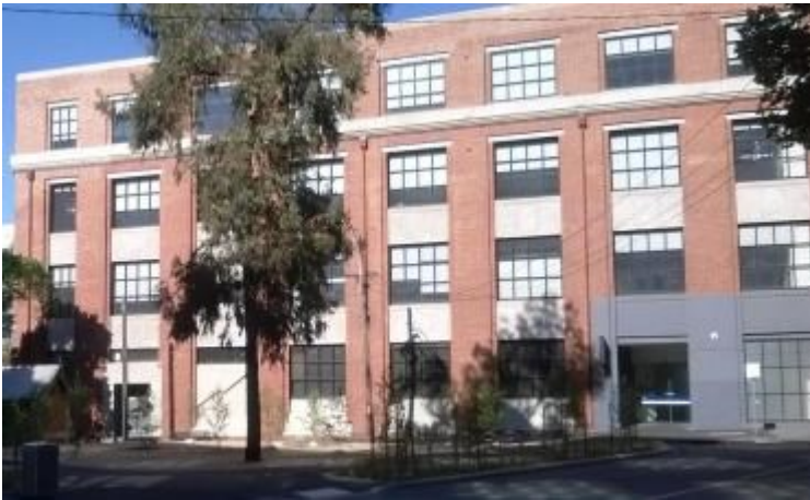
Mid City North – Proposed Key Intersection: Barry, Queensberry and Leicester Streets, Carlton