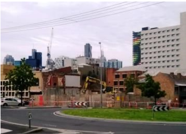
The Corkman was here – 16 October 2016

The pair then have until 2022 to redevelop the site in a form approved by the planning minister.