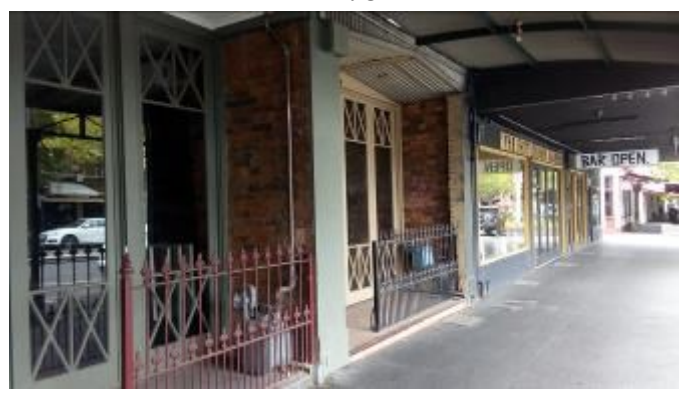
The sad state of Lygon Street

The decline in local shopping strips is not confined to Carlton. The changing nature of the retail environment means cities need to plan for alternative uses. The City of London, for example, is preparing for 30% of retail space to change.