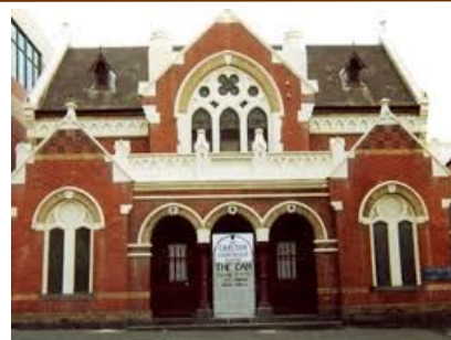
La Mama Courthouse