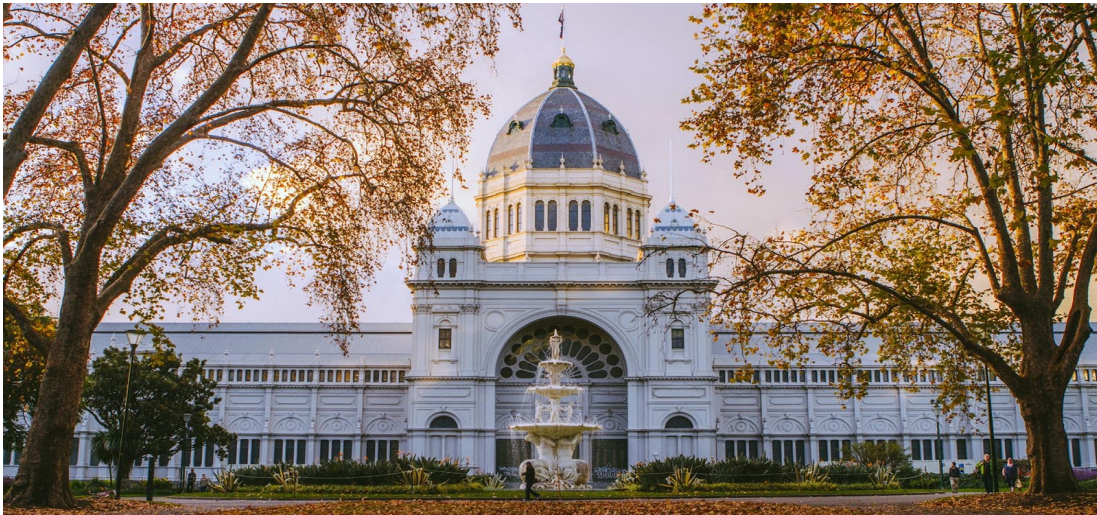
World Heritage Environs Area under review