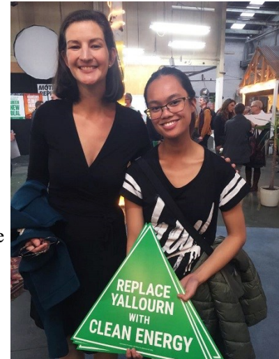
Ellen Sandell at 2020 Climate Forum

Ellen is a State MP for the Greens in Melbourne.