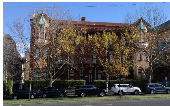
Old Children's Hospital Former Nurses Home Rathdowne Street

In this Amendment, the City of Melbourne has determined that ALL the existing letter graded heritage places should be re-graded (re-categorised) as either Individually Significant (whether within or outside precinct overlays) or Contributory. More specifically, according to the Council's lead barrister, 'all properties the subject of the grading's review are either individually places of Local Significance or parts of precincts which are of Local Significance.' (Council's Part B Submission to the C258 Planning Panel pp 34-35).