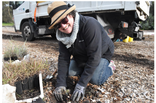
Habitat planting in Royal Park.

It has to be one of the most beautiful vaccination centres in the world; what a treat to see inside this World Heritage Listed gem without furiously penning exams! You may see Council's 'Vaccine Hero' promotions about. We aim to be the most vaccinated city in Australia, safeguarding public health and ending the need for lockdowns. Best to book online or phone 1800 675 398. Dial '0' for an interpreter. Continued on page 6