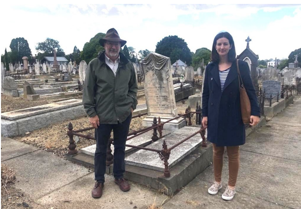
Greens State MP for Melbourne Ellen Sandell meets with a local resident to discuss an initiative to improve the historic Melbourne General Cemetery

The last 18 months has shown all of us how much we need and value green open space. And in the inner city, every patch of green space is precious!