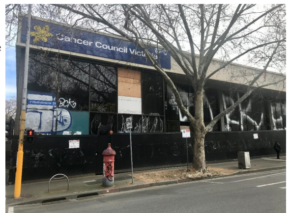
The eyesaw on the corner of Rathdowne Street and Victoria Street.