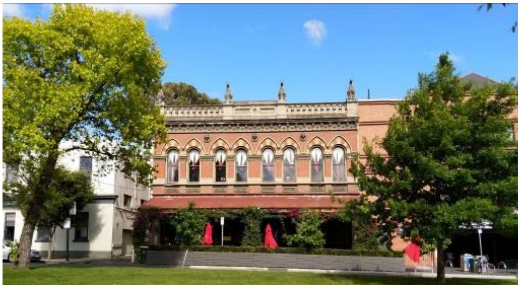
313 Drummond Street Masani Bistrot – One of many Significant Heritage Places in the Carlton Precinct without a Statement of Significance

The incredibly small number of Individual Statements of Significance is both surprising and worrying. These Statements are intended to be the principal guide to the 'how' and 'why' a Place is regarded as Significant. For many (if not most) of our Significant Heritage Places, it will be impossible to ascertain from the Precinct wide