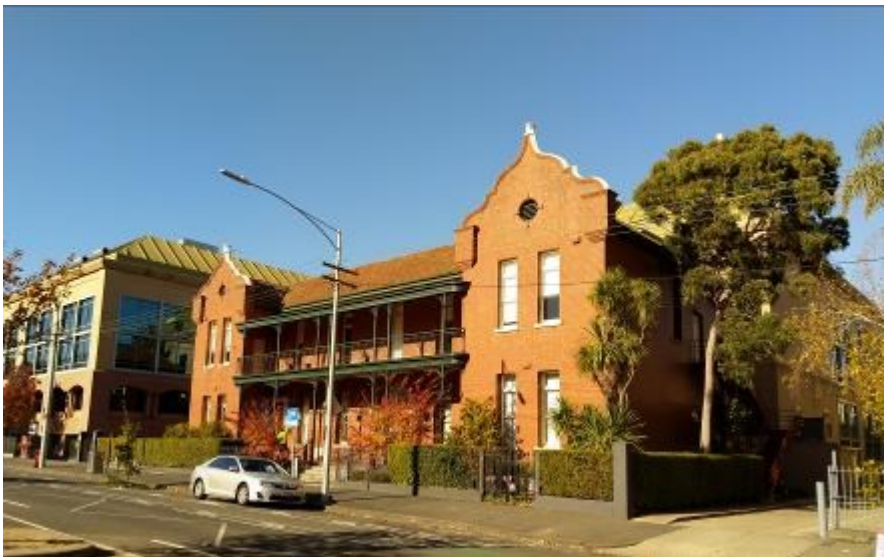
Former Children's Hospital Administration Block – 15-31 Pelham Street