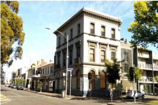
170 Elgin St Carlton, North West Corner of Drummond Street [December 2021, E. Ogilvy]