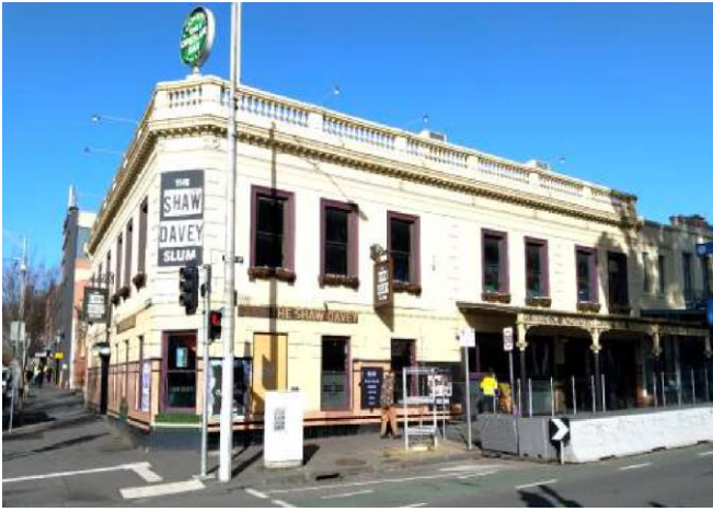
171 Elgin Street Shaw Davey Slum Hotel, South West Corner of Elgin & Drummond Streets [August 2022 E. Ogilvy]