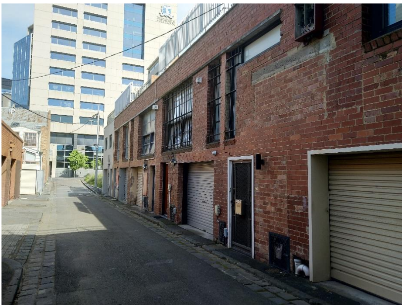
Leicester Place looking west [Loading and waste removal from proposed development would BLOCK access to garages fronting Leicester Place – above and below]

In the Association's view, there are several operational aspects that are a disaster for adjacent residential properties. For example, loading and waste removal is planned via Leicester Place [a lane less than 5 metres wide adjacent to the hotel site]; this takes no account of vehicle access requirements for properties with off road parking accessed from Leicester Place [See images below].