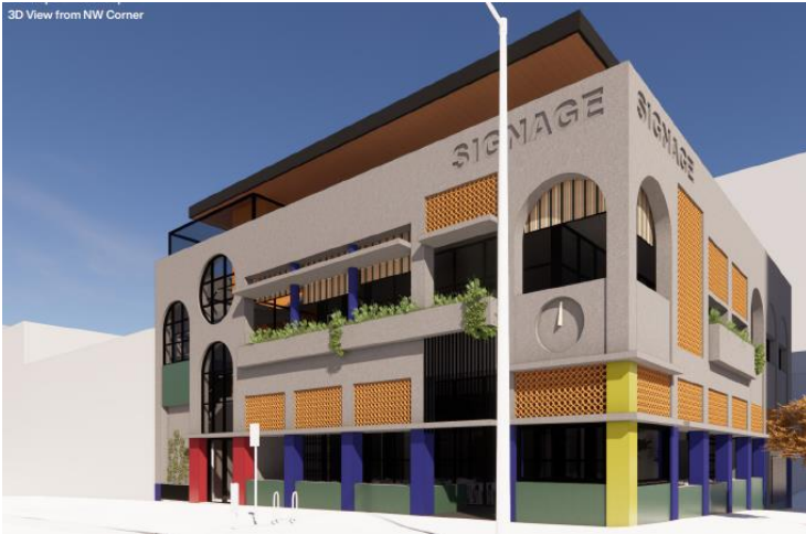
Image extracted from Applicant’s Development Concept Plan

However, in our view, the style and architectural expression is visually DOMINANT. More specifically, the façade treatment is not recessive; the architectural language [both the colour palette and design] is quite flamboyant. In this respect, the design COMPETES for attention with the heritage places to the immediate east and south of the development site. This is NOT appropriate.