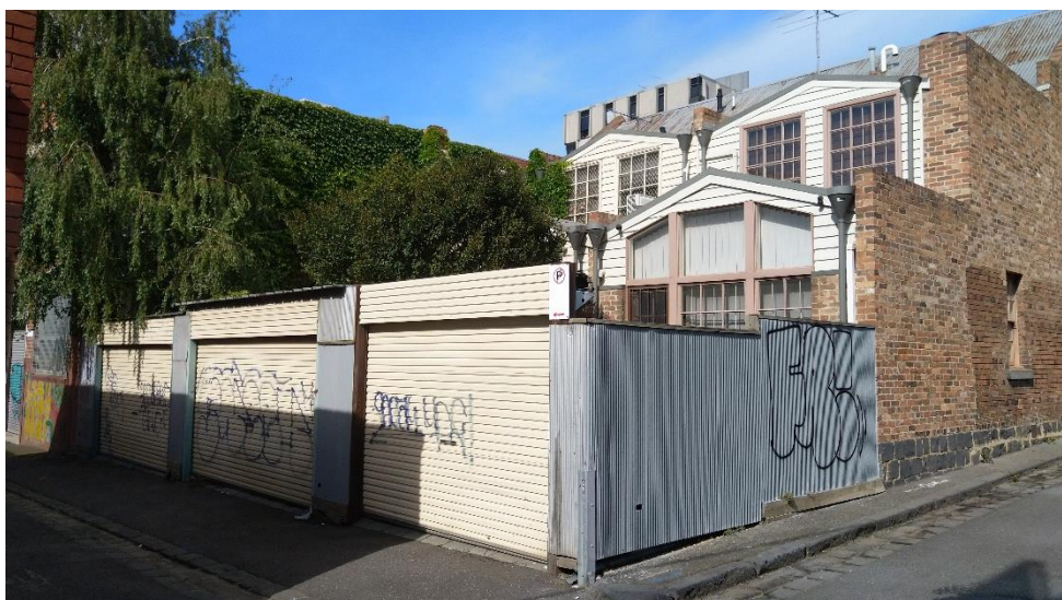
Rear access to properties fronting 148-152 Leicester Street

In the Association's view, it is quite inappropriate for the Applicant to treat a narrow lane as a Loading Zone, or waste removal location.