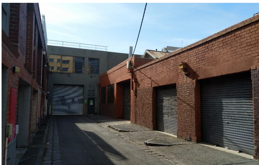
Leicester Place looking east