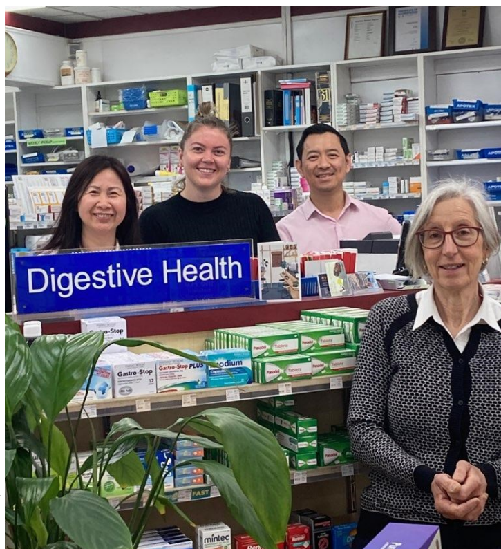
Pickford Pharmacy Staff

Pickford's has been a strong supporter of CRA and its activities for many years.