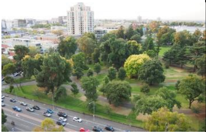
Damage to the Carlton Gardens after MIFGS

In September 2022 a 3 year licence was granted to MIFGS (2024 - 2026) with a 3 year option (2027 - 2029) by mutual agreement. As reported in the Inner City News (September, 2022) under the