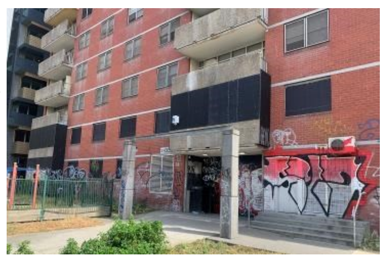
Deserted Nicholson Street towers, scheduled for demolition

Until they are demolished, the towers will continue to deteriorate and become an even greater eyesore as well as a public safety issue for local residents, most especially those living in adjacent housing. Surely, too, the presence of the towers will devalue adjacent properties, including those currently being constructed.