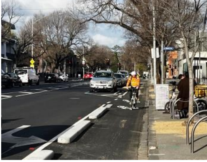
Queensberry Street could be similar to recently changed Grattan Street

The changes would make it safer for pedestrians and bike riders and additional greening could be introduced.