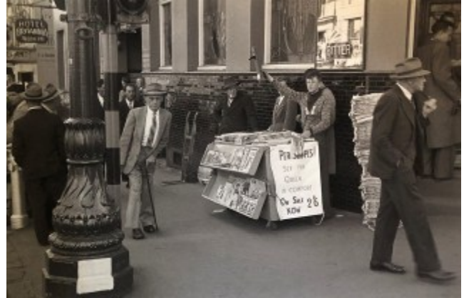
Bluestone footpaths are a recent addition to Melbourne streetscapes.

Melbourne trivia: Why is Exhibition St in the city is so named? Because it leads to the exhibitions! Previously called Stephen St in Robert Hoddle's schema, it was renamed by Melbourne City Council in 1898, after the REB was built and had hosted its first two great exhibitions.