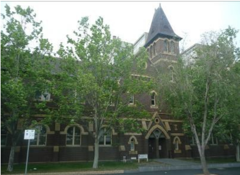
Kathleen Syme Community Centre and Library 2008